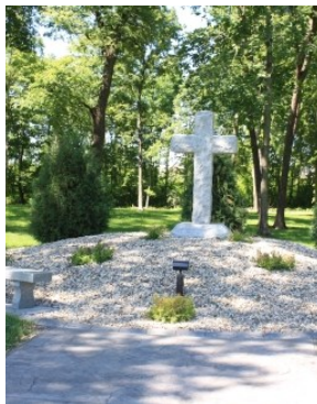
Resurrection Garden at Calvary Cemetery in Mankato

The Church insistently recommends that the bodies of the deceased be buried in cemeteries or other sacred places.