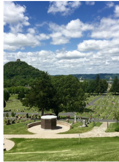
Columbariums at St. Mary's Cemetery in Winona

The Book of Ecclesiastes teaches us that there is a time and a place for everything. Catholic Cemeteries are designed to provide a sacred place to honor those who have gone before us. In honoring our deceased loved ones, we not only remember the special way that they have touched our hearts, but more importantly we remember the way God was able to touch their hearts. It is not enough to remember the good our loved ones have done, we must also entrust their body and souls into God's merciful goodness. The sacred ground of a Catholic Cemetery reminds us, that while we may not be perfect, we are perfectly loved by God who is all good and all loving.