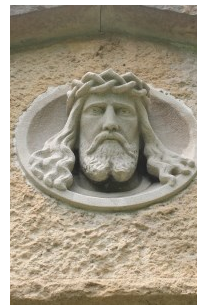
Relief sculpture of Christ's head on Calvary Chapel in Calvary Cemetery, Mankato